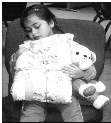
Child attending the "Good Grief" family and children's bereavement program.

From the beginning, Lovejoy Hospice's attention to and honoring of life has been the key to compassionate and caring service for patients and families. But that special attention has also allowed the organization to adapt to change, to transform many obstacles and to endure and thrive as Southern Oregon's only community-based not-for-profit hospice service. Lovejoy Hospice continues to reflect the dreams and vision of its founders and its community.