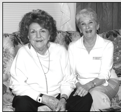
Patient with Lovejoy Hospice Volunteer

April 19 Awards Celebration May 11 Mother's Day Memorial Workshop Jun 15 Father's Day Memorial Workshop Jul 16 Funeral Planning Aug 13 Estate Planning Sept Volunteer Training Oct Advanced Directives, Caregiver 101 Nov 7 Holiday Blues—Coping with Grief Dec Light Up A Life—Community Memorial for Loved Ones