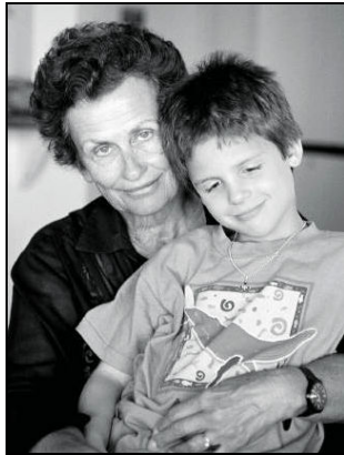
"Good Grief" program helps families

This is a partial list of donors, funders and supporters from 2008. If we failed to list your name, or listed it incorrectly, please accept our apologies and let us know so we can correct our records.